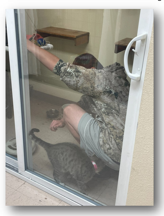
Students from YHS volunteer at Saving Grace Pet Adoption Center once a week.